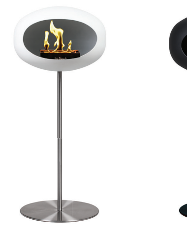
Le Feu Steel White €1,925.00